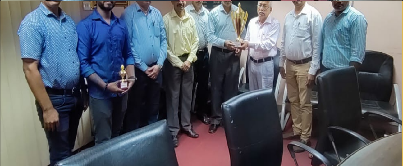
Our Bank won the trophy in the cricket tournament organised between RBI, NABARD & The Goa State Cooperative Bank Ltd.