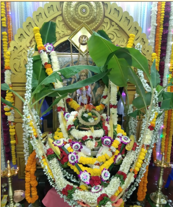
Maha Satyanarayan Pooja Stapan on 6th floor of Sahakar Sankul.