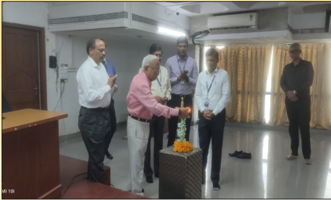
Lighting of lamp during inaugural function of Two days Training Programme for the Auditors of the Bank.