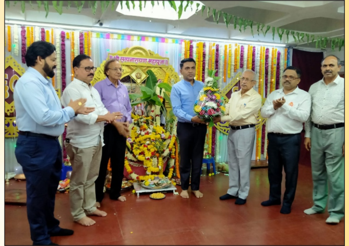
Chief Minister's visit for Pooja blessing on Bank's foundation Day.