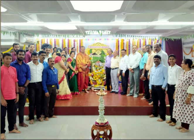
Managing Committee & staff at Pooja Rituals.