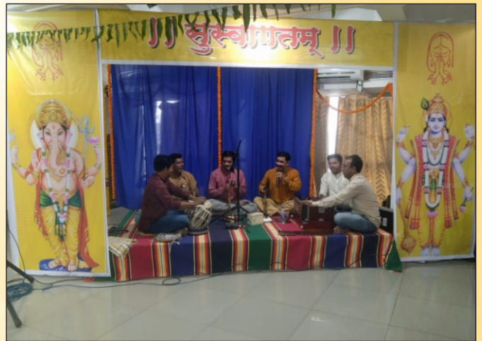
Cultural Program on Banks Foundation Day (2nd Feb.2023).