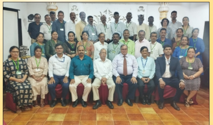
Chairman, Managing Director of the Bank and NABARD Officials along with the participating Branch Managers & Senior Officers during Two days Residential Workshop at Calangute.