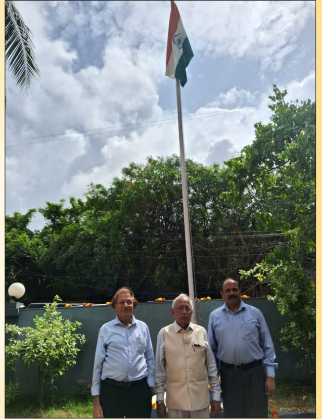
Flag Hoisting at Head Office on the Occasion of 76th Independence Day .